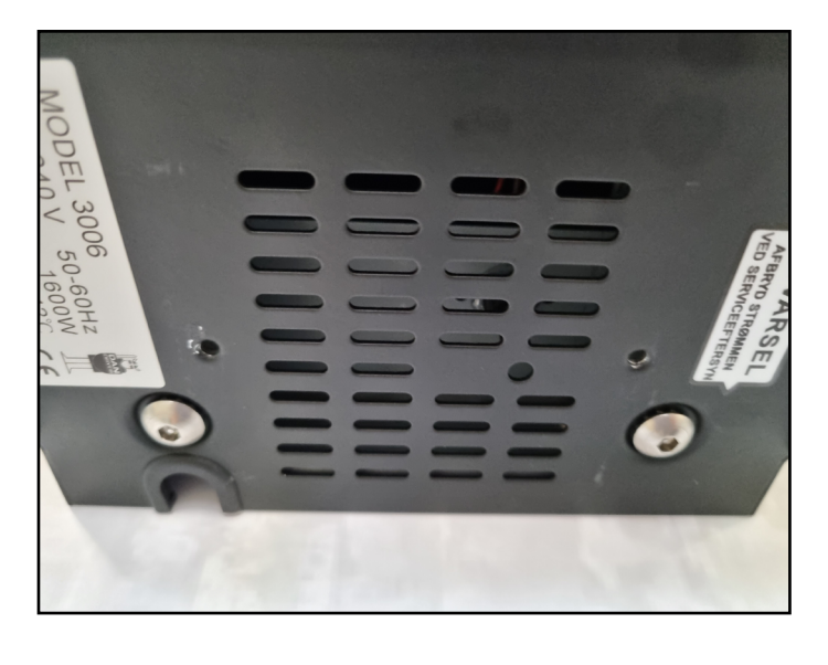
1. Locate the mounting holes on the foot of the dryer. Remove existing filter holder, if any, before the new unit can be installed.