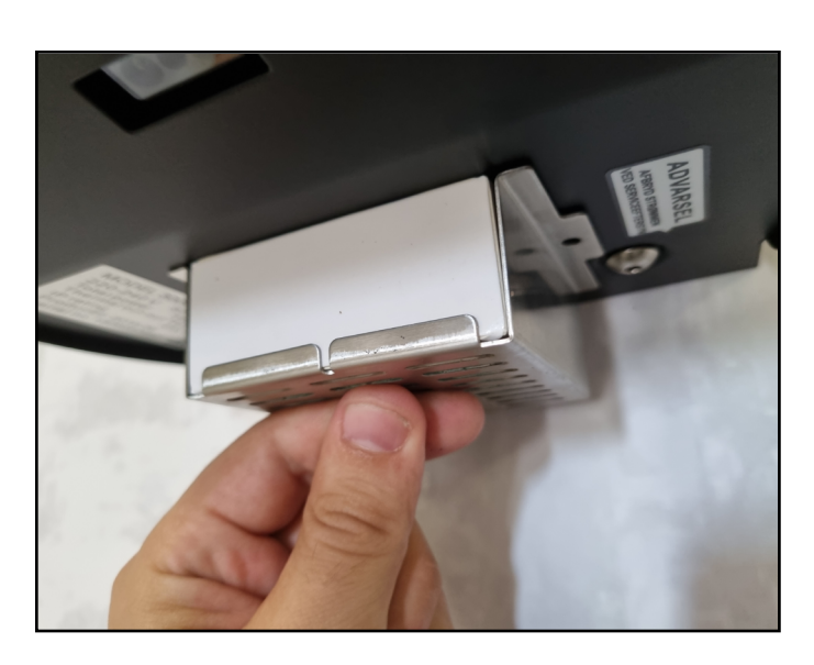
2. Place the filter unit on the holes over the air inlet.