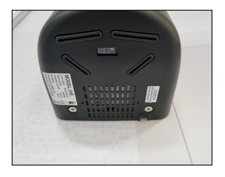
1. Locate the mounting holes on the foot of the dryer. Remove existing filter holder, if any, before the new unit can be installed.