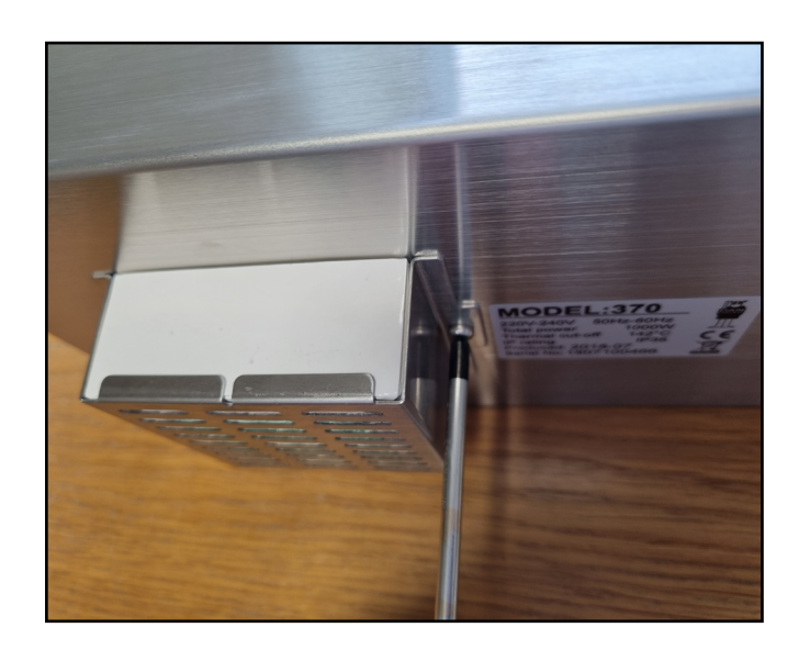
3. Fit and fully tighten the security screws on both sides.