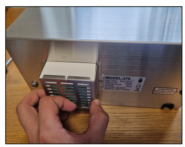
2. Place the filter unit on the holes over the air inlet.