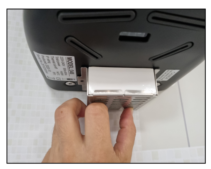
2. Place the filter unit on the holes over the air inlet.