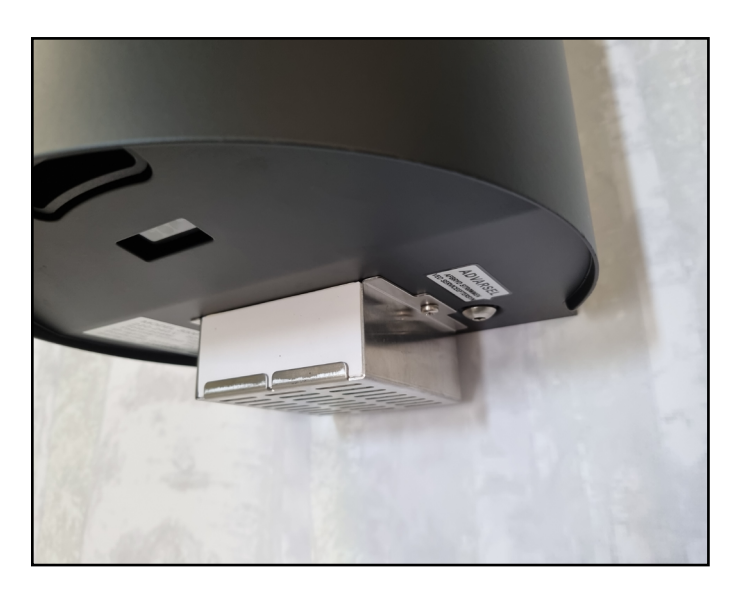
4. Installation/replacement of the filter is now complete.