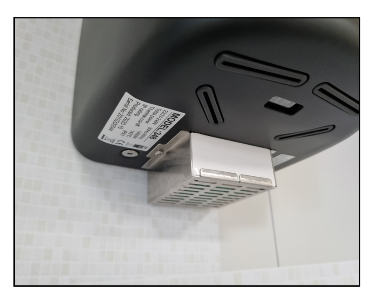
4. Installation/replacement of the filter is now complete.