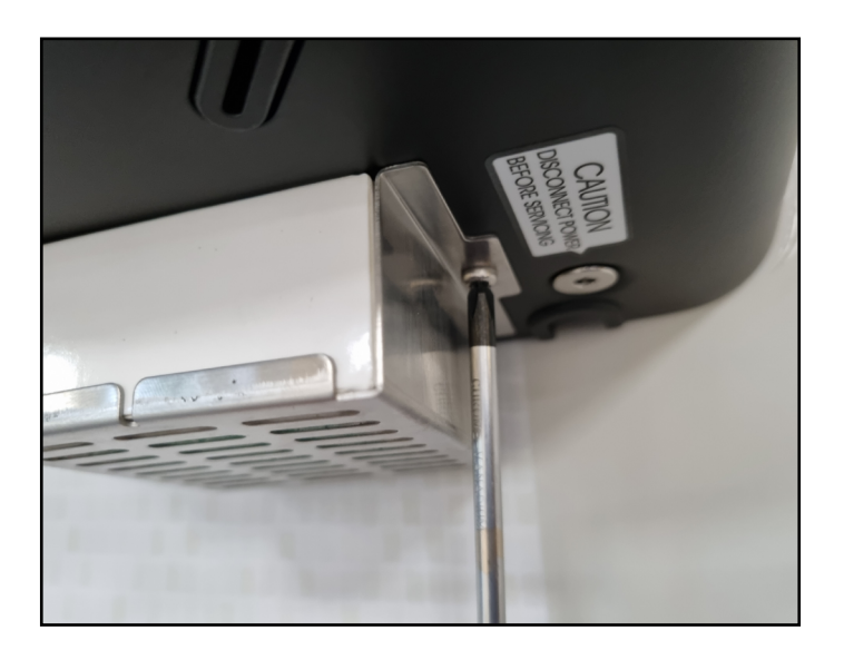
3. Fit and fully tighten the security screws on both sides.