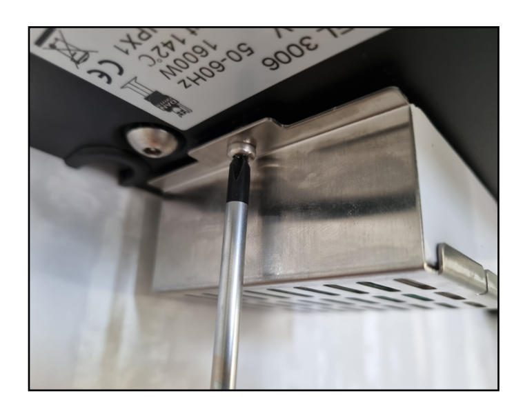
3. Fit and fully tighten the security screws on both sides.