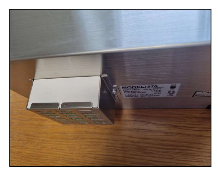
4. Installation/replacement of the filter is now complete.