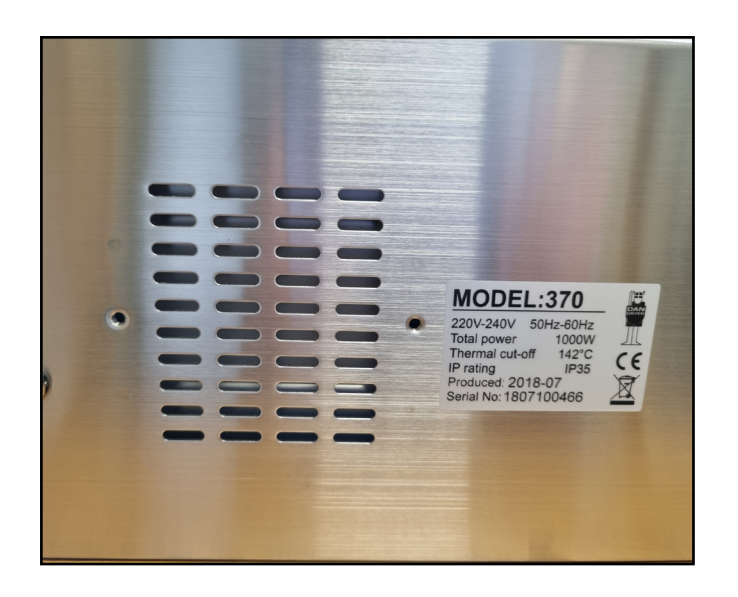
1. Locate the mounting holes on the foot of the dryer. Remove existing filter holder, if any, before the new unit can be installed.